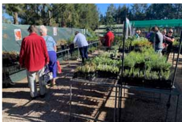
Customers doing a good job of social distancing at the plant sale

A difficult year for all Friends groups. We didn't submit anything from Orange because we haven't done anything due to the pandemic. Our last contribution was mainly about cancelling our Autumn sale due to the pandemic. We are doing our November plant sale at the moment by spreading it over two weekends and have found it works well to have people booked in so we can ensure there isn't a bun rush at the beginning and people are separated in time and space to ensure social distancing. When they book, they know they will have an hour to browse and so it is much more relaxed for both customers and Friends staffing the sale. We still made as much