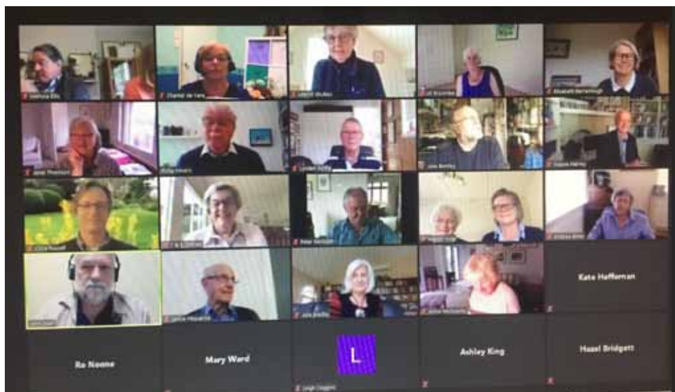
Some of the ZOOM AGM

We are all looking forward to having a face to face AGM next year in Adelaide. Let's keep our collective fingers crossed.