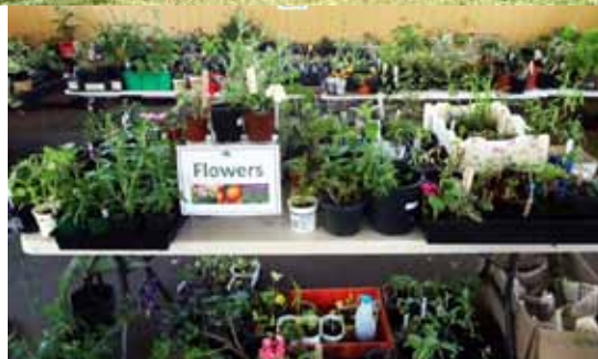
Queueing to 'buy' free plants