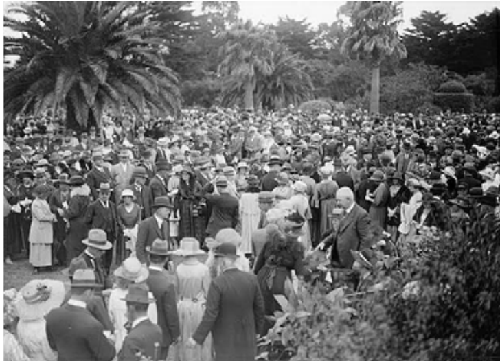
Williamstown Botanic Gardens 13 December 1922.

A small team of Friends has been working during ISO on correcting newspaper articles on the Williamstown Botanic Gardens in Trove, the on-line database hosted by the National Library of Australia. It is hoped that the corrected articles will help in future garden research.