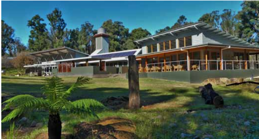
Eurobodalla Visitor Centre in July 2020.

Eurobodalla Regional Botanic Garden is returning to life after the Black Summer fire that destroyed most of the Garden. This recovery is only thanks to the heroic efforts of staff, Friends, volunteers and the whole community who have worked to rebuild and regrow what was burnt. And Nature has done her own amazing thing as well.