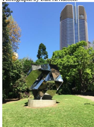
Morning Star sculpture relocated nearer to Alice Street.