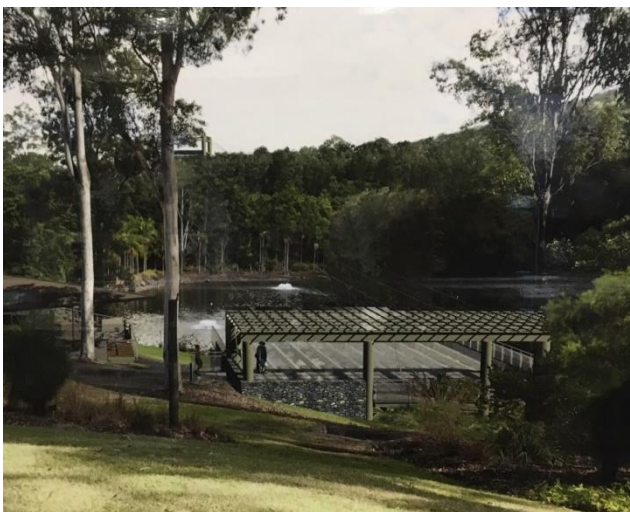
Artist's rendering of landing Deck for six ziplines and adjacent Amenity Block building also showing the tower on top of the hill at the back of the Botanic Gardens

We continue to reject and resist the insertion of the ZIPLINE into the MCBG and across Mt Coot-tha generally. We keep finding more worrying negative effects. Losing the peace and quiet remains the main problem. Losing all the trees around the Australian Plant Communities area will be tragic.