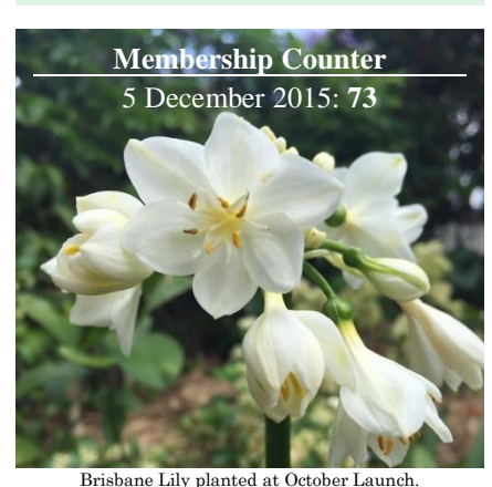
Check out blooms in November [MJK]