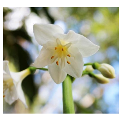
Priophys cunninghamii

LOGO explanation: Three flowers representing the three botanical collections: OBBG, MCBG and SA.