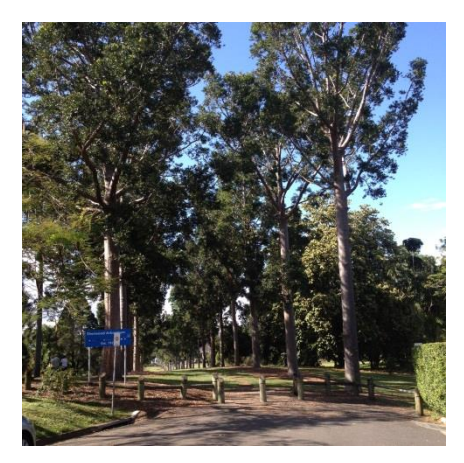
Joseph Street (northern) Entry 31 October 2015 (JSim)