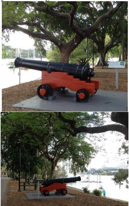
Views taken 25 November 2015 (JSim)

One of the original cannons in the Battery (established in 1862!) has been reinstated! No pot-shots at the yachts or Kangaroo Point allowed!