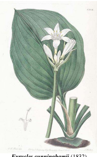
Eurycles cunninghamii (1832) Edwards's Botanical Register; Consisting of Coloured Figures of Exotic Plants Cultivated in British Gardens; with their History and Mode of Treatment. London