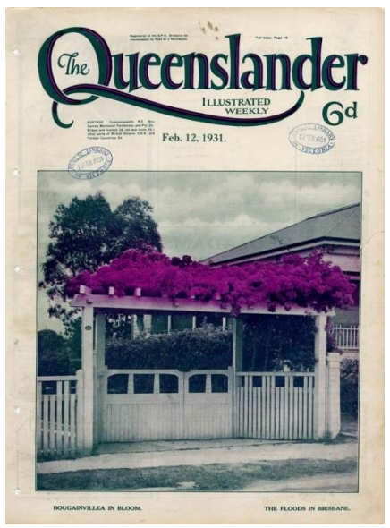
This cover page of the weekly newspaper The Queenslander from 1931 salutes the bougainvillea as a colourful gateway arbour cover.

It's November and the Bougainvilleas are looking magnificent around Brisbane with their gaudy shawls of deep red, purples and obscene purplish-pinks draped across the verdant green landscape.